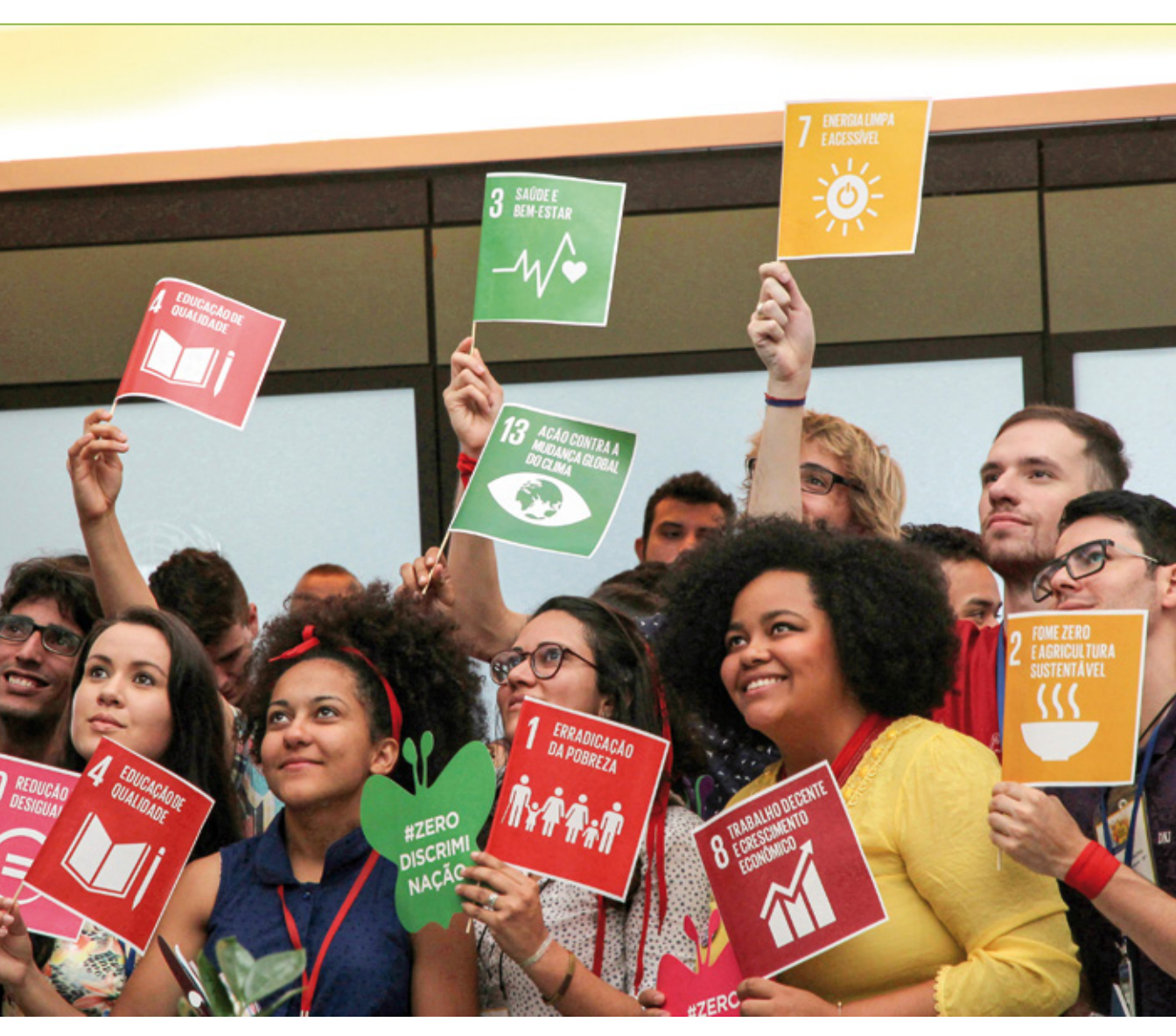
SDG flag-raising ceremony at UN House in Brasilia, Brazil.

The Government of Brazil has been a long-standing champion of sustainable development as the host of the 1992 Earth Summit and the 2012 Rio+20 Conference. The Brazilian Institute of Geography and Statistics (IBGE) has represented the Mercosur countries and Chile on the Inter-Agency and Expert Group on Sustainable Development Indicators and has been elected as the new Chair of the UN Statistical Commission, actively contributing to the task of developing the SDG indicators at the global level. Both IBGE and the Interministerial Working Group on the Post-2015 Development Agenda — encompassing 27 ministries and bodies of federal administration — have undertaken consultations with different stakeholders to reflect Brazil's contribution to implementing the SDGs.