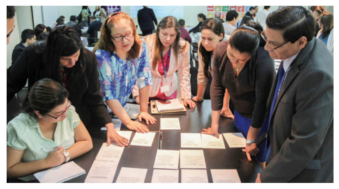
Salvadoran public servants identify the links between the SDGs and the national Five-Year Development Plan.

To overcome the monitoring and reporting challenges posed by the 2030 Agenda, the Technical and Planning Secretariat of the Presidency and the Ministry of Foreign Affairs have been working with the UN to review the complete list of SDG indicators, as a first step towards defining national targets. This work includes the development of a second series of workshops with Salvadoran public institutions, aiming at fostering multilateral dialogues on the issue and generating the seed for the creation and implementation of a one-of-its-kind national development agenda for the SDGs.