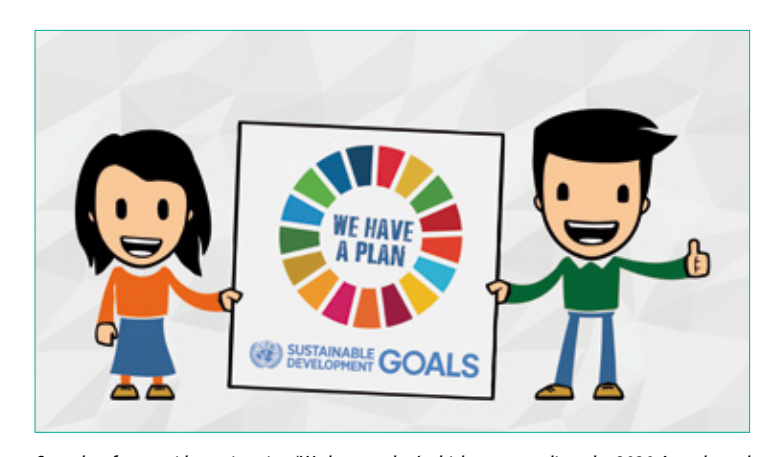
Snapshot from a video animation 'We have a plan' which contextualizes the 2030 Agenda and the SDGs.

Montenegro's ambitions as an 'ecological state' pursuing sustainable development path stem from the 1990s and were reflected as early as 1992 in the text of the Constitution. This interest was further reflected in the country's high level of participation in global debates on the formulation of the SDGs, particularly through the Open Working Group, where the views of 12,000 people from national consultations 'Montenegro - the Future I Want' were presented.