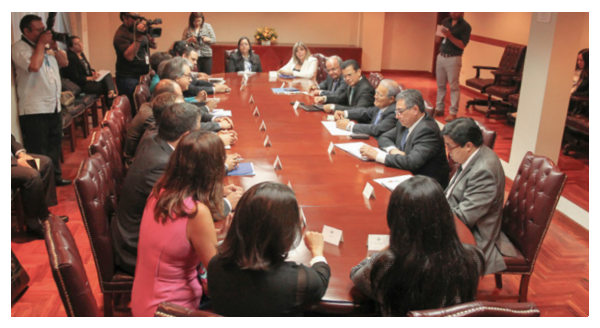
President Salvador Sanchez Cerén meets with representatives of the UN system in El Salvador, prior to the series of SDG workshops for public servants.

The current Five-Year Development Plan (2014–2019) has already been studied and analysed in relation to the 2030 Agenda and the SDGs. Among several similarities found, it is of particular interest to note that SDGs 8 (decent work and economic growth), 4 (quality education) and 16 (peace, justice and strong institutions) clearly embody the three main priorities defined in the Plan: (i) productive employment generated through sustained economic growth; (ii) inclusive and equitable education; and (iii) effective citizen security.