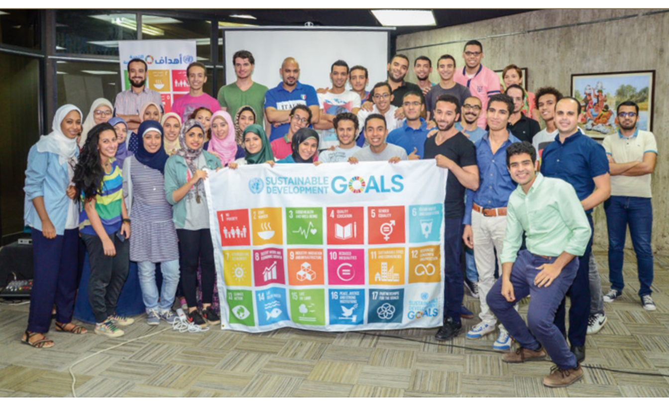
Egyptian youth came together to support the SDGs during the 'Open Code for Sustainable Development' camp in Cairo.