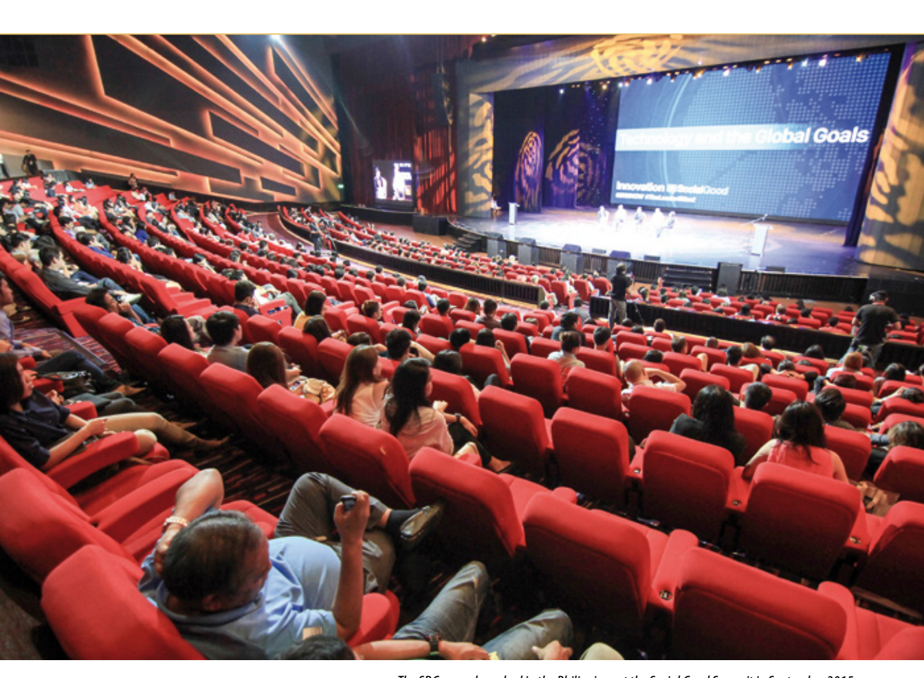
The SDGs were launched in the Philippines at the Social Good Summit in September 2015, organized by social news network Rappler with support from the UN.

In October 2015, NEDA, in coordination with the PSA and with UNDP support, conducted the First Technical Workshop on SDGs Indicators. This event was attended by 269 participants from various national government agencies, CSOs, academic institutions and the UNCT. Then in May 2016 the Second Technical Workshop on SDGs Indicators was convened with over 300 participants to inform the report by the Philippines to the Voluntary National Review for the HLPF in July. At these workshops, the initial list of SDG indicators was examined within the context of the country's development objectives, and relevant indicators that were not included in the list were identified. The participants also assessed whether data on the SDG indicators were available from existing data sources, and prioritized those that should be part of the country's core indicators. Building on such basic mapping activities, 231 global indicators were examined and prioritized in accordance with the national context, while 23 additional national indicators were presented for SDGs 2 (zero hunger), 3 (good health and well-being) and 5 (gender equality). The Department of Labor and Employment also initiated technical workshops with support from the ILO in May 2016 to identify and update indicators for SDG 8 (decent work and economic growth) and other goals covering elements of decent work. This led to a mapping of indicators in the Philippines covering decent work.