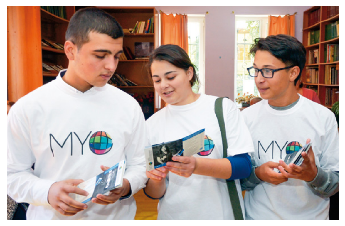
Students from different Georgian universities take part in the MY World information sessions in Mtskheta.

With the support of the National Statistics Office of Georgia (Geostat), a reliable information base has been analysed to set the baseline indicator for each target. Geostat has worked with the line ministries to collect the relevant data and analyse weaknesses of disaggregated statistics. As of early 2016, nearly 120 indicators have been identified as having baseline data. Still, the lack of statistical data remains a challenge to setting reliable quantitative indicators.