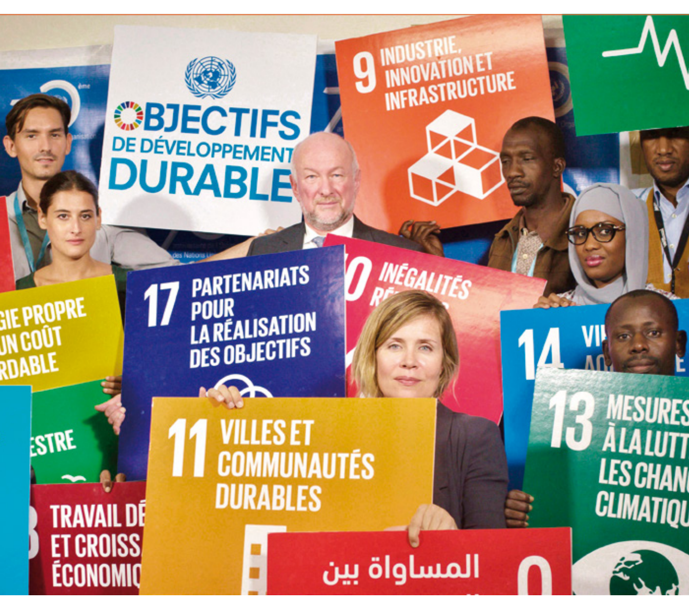
UNCT Mauritania, communicating on the SDGs, Nouakchott, Mauritania.

Furthermore, representatives of marginalized groups, such as the Association for Disabled, Blind and Visually Impaired People, have taken part in the work to mainstream the SDGs into the Strategy of Accelerated Growth and Shared Prosperity, including in awareness-raising workshops and technical work to prioritize the SDGs.