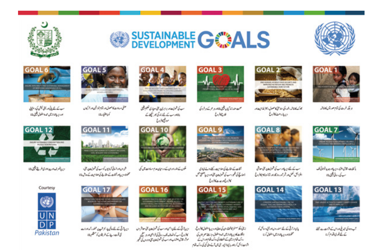
SDGs infographics in the national language (Urdu).

The initial assessment portrays a dismal picture of the availability of data at federal level for SDG 3 (good health and well-being), SDG 12 (responsible consumption and production), SDG 14 (life below water), SDG 15 (life on land) and SDG 16 (peace, justice and strong institutions). Also, the data gaps widen as the analysis moves from the national to the district level. The findings show that data for most of the indicators for SDGs 9 (industry, innovation and infrastructure), 10 (reduced inequalities), 12 (responsible consumption and production) and 15 (life on land) are not available at district level. District-level data are costlier and require greater effort to collect and analyse because of the larger sample size and disaggregation required.