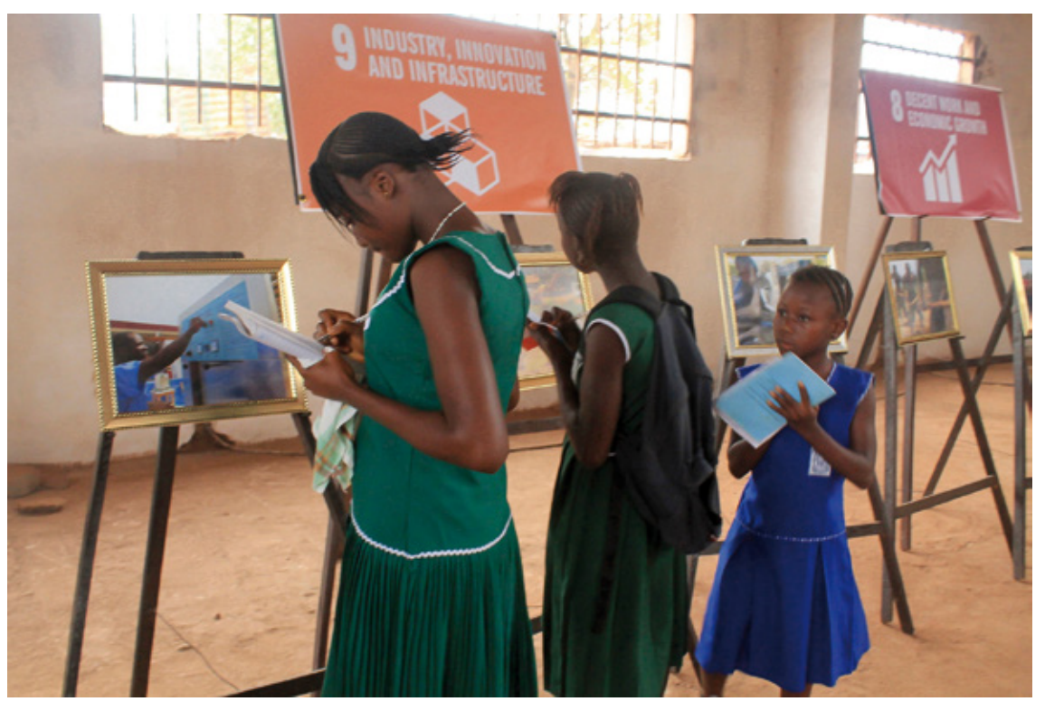
School girls in Sierra Leone ponder about SDG 9 (industry, innovation and infrastructure).

Lessons learned from the Ebola crisis and the collapse in international iron ore prices informed the development of the National Ebola Recovery Strategy/Presidential Recovery Priorities (2015–2017). The objective is to ensure that the country maintains zero cases of Ebola while 'building back better' national systems for resilience and national development, including preparedness to face future shocks and epidemics. The national strategy comprises seven presidential priority sectors: health, education, social protection, private sector development, water, energy and governance. Implementation of the first phase ended in March 2016, and the second phase started in April 2016. Discussions are under way for the presidential priorities to integrate the SDGs.